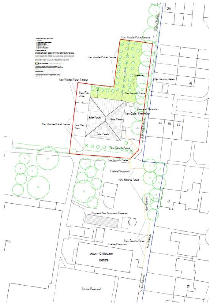
PART SITE PLAN 1:250